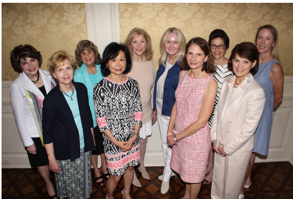
2016-2017 Healthy Charlotte Alliance Board of Directors

We thank our board, staff and members of Healthy Charlotte Alliance for their unwavering commitment and donation of time, talent and resources to meet our objectives and achieve our mission of building a healthier Mecklenburg County.